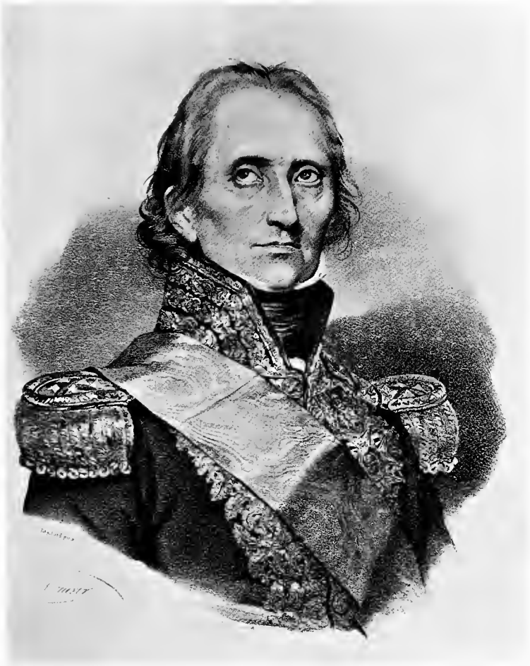
JEAN DE DIEU SOULT, DUKE OF DALMATIA FROM A LITHOGRAPH BY DEL'ÉCH AFTER THE PAINTING BY ROUILLARD